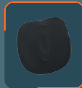
Option: REF.70020 Large lumbar pad